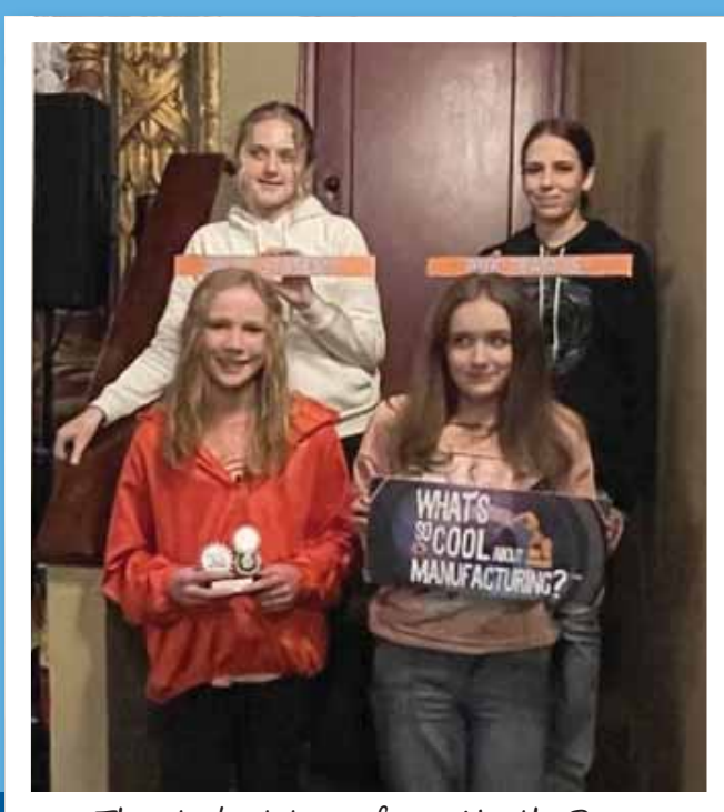
The student team from North-Penn Liberty won the "Northern Tier Influence" award and also moved on to the statewide competition in Harrisburg.