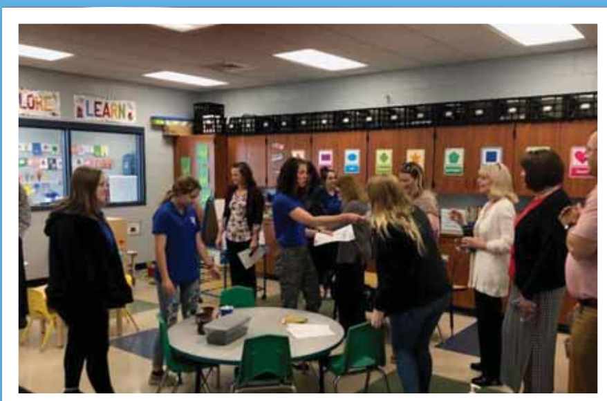
Early Childhood Education Tour

Participants were divided into two tour groups and were able to observe students in their chosen programs of study. Northern Tier Career Center has 12 robust programs of study. More information can be found at ntccschool. org. Meeting attendees were able to talk to students and instructors during the tour. Members stated that it was nice to make connections with students and instructors when the tour was completed. Students at the career center are sought after by local employers because their training prepares them for immediate employment when they complete their program of study.